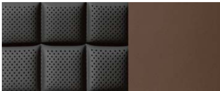
Interior Chestnut Brown leather accented seat trim †

* Vehicle towing capacity is subject to towbar/towball capacity and design. Towing capacity may be reduced if a non genuine Nissan towbar is fitted. Please refer to the Genuine accessory brochure for towbar capacity information.